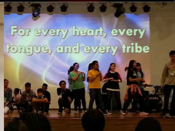
All of our Form One Catholic students and some Form Two students attended The SEED 14 at the Grand Hall, Level 3 of the ACCPC on 13 and 14 September 2014. This is an annual event organised by the Sarawak Catholic Teachers' Guild and run by the Empowered Ministry.