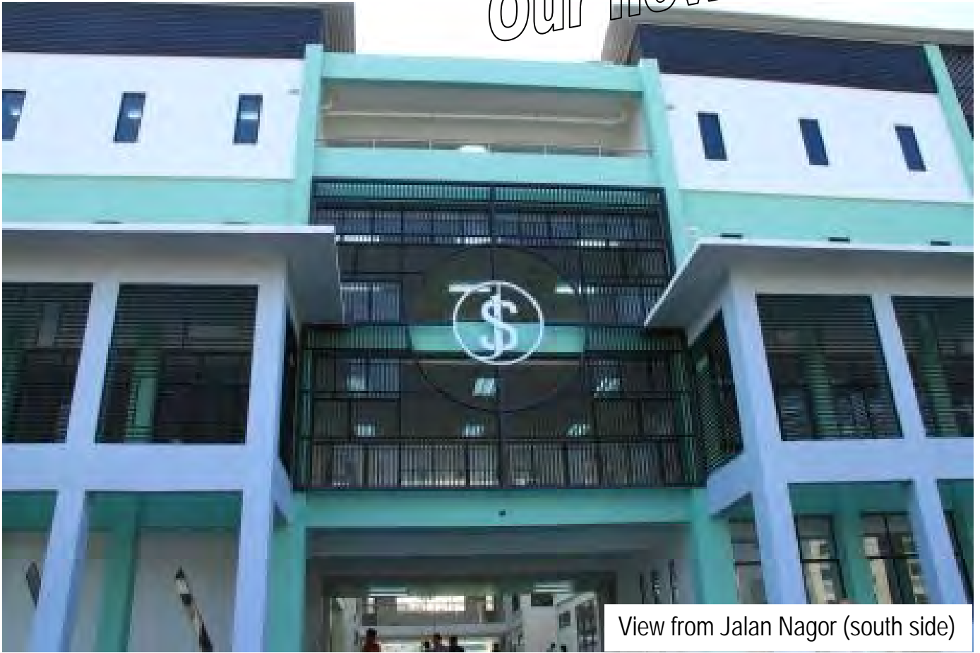
View from Jalan Nagor (south side)