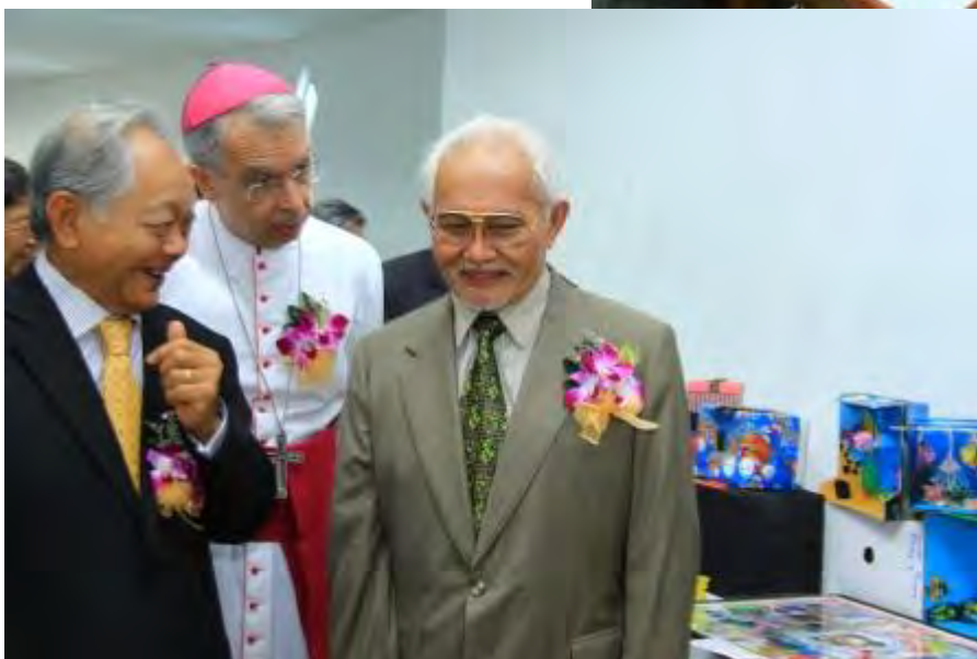
The VIPs visiting the exhibitions

FOR MORE PHOTOS, GO TO OUR SCHOOL WEBSITE